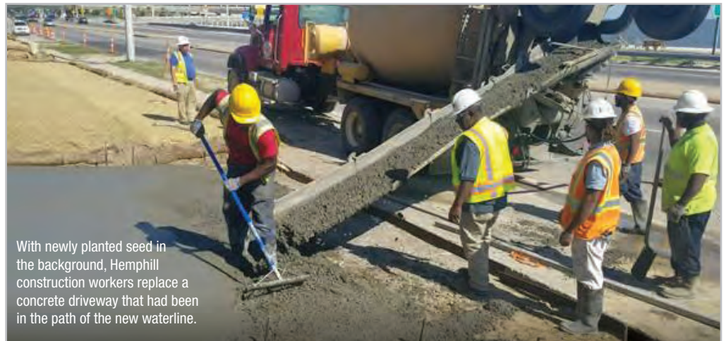
With newly planted seed in the background, Hemphill construction workers replace a concrete driveway that had been in the path of the new waterline.