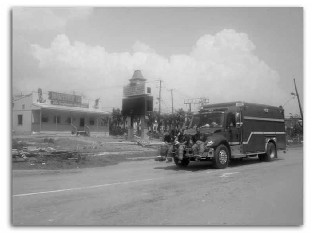
Biloxi firefighters enjoy a brief breeze while traveling the debris-lined U.S. 90.

If you have any questions or concerns, call the Community Development Department at 435-6280.