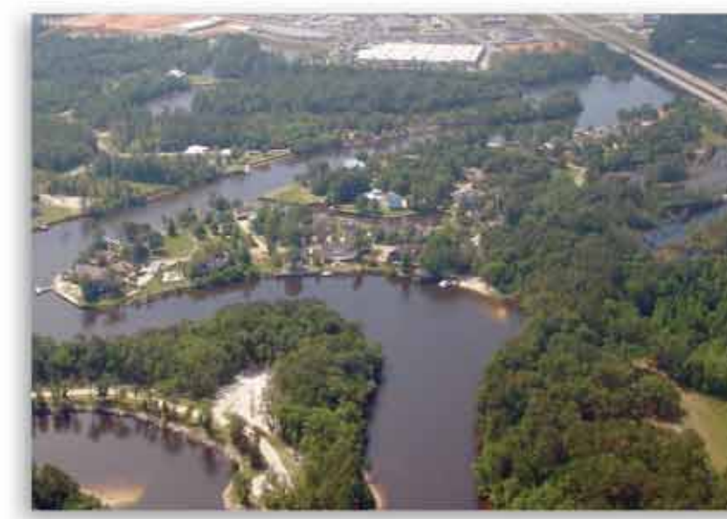
Wells Ferry area on a typical day.