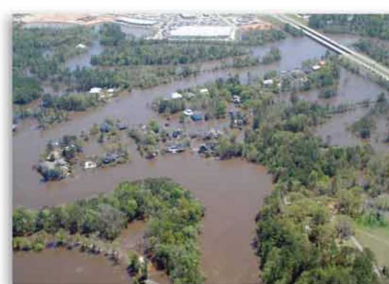
Wells Ferry area after 10 hours of rain.

• The key is to be in a good position to make a sound decision on the action you need to take.