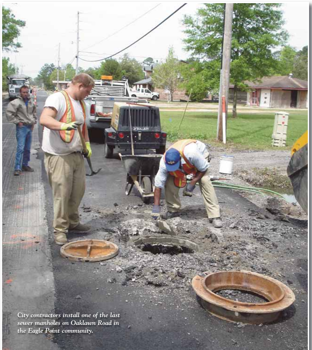
City contractors install one of the last sewer manholes on Oaklawn Road in the Eagle Point community.

The city plans to award a contract for water and sewer work northward on Highway 67 in April. The 300-day contract has a budget of $2.2 million.