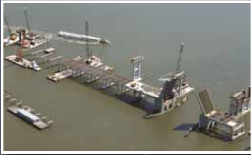
New pilings tower over the old draw