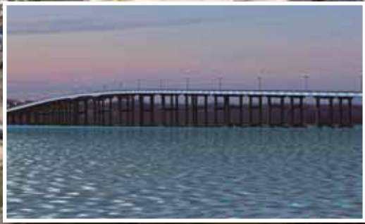
A rendering of the completed twin span