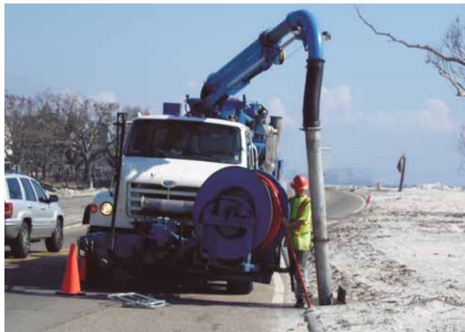
MDOT crews spent weeks vacuuming debris from storm drain lines along U.S. 90.

Rodenburg Avenue to Myrtle Street in Biloxi and continuing throughout the entire county. In addition, the project will now include the permanent installation of signals. A series of contracts will be awarded this summer and will be issued on an accelerated schedule to expedite the construction process. Work to rebuild the highway will include the replacement of curbs, repairs to the drainage systems and sidewalks, resurfacing and the installation of a state-of-the-art traffic signal system with mast arm signal poles.