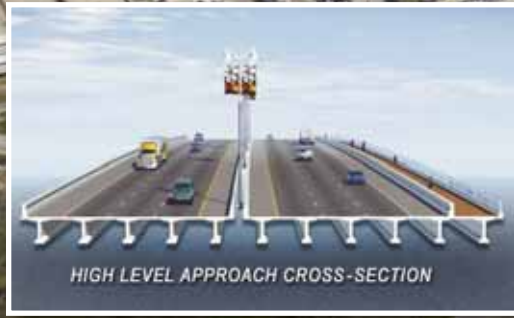
A breakdown of the lanes of the twin span